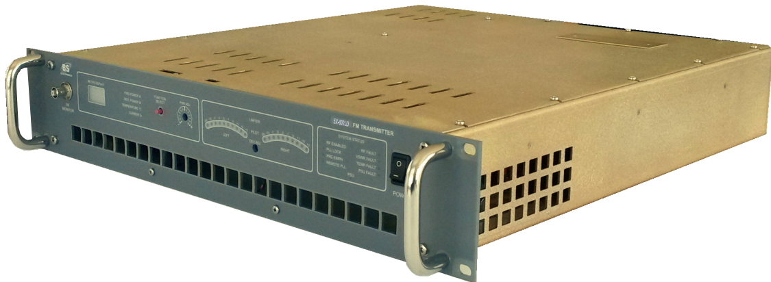
EX-500LD 500W FM Transmitter

The EX-500LD includes an external wideband composite input and auxiliary input for RDS/SCA, both with external rear panel adjustment OR (Option 2) internally supplied RDS encoder factory Programmed.