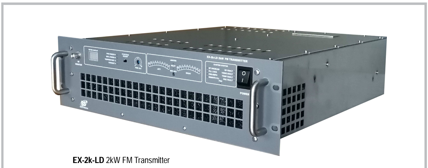
EX-2k-LD 2kW FM Transmitter

The EX-2k-LD includes a wideband composite input and auxiliary input for RDS/SCA, both with external rear panel adjustment, Internal RDS encoder factory Programmed (Option 2) .